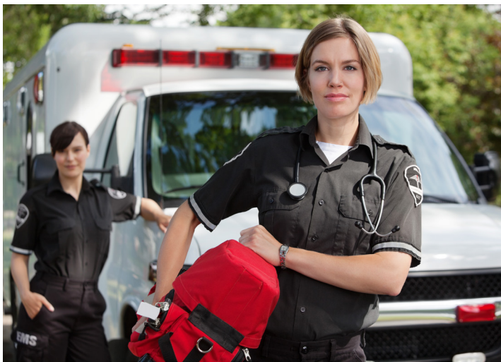
Enable your team to use Orion Push to Talk directly from their iOS smartphones, anywhere they go